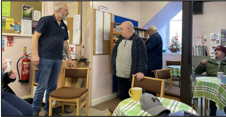
Sandbag Cafe Longridge is now open every Tuesday at Christ Church Methodist Church.

A stand is being created so that the standard will be able to be on permanent display in the VIC Centre foyer.