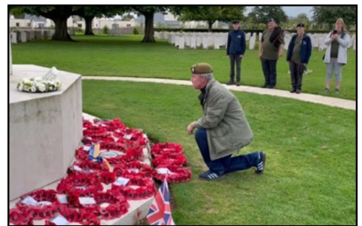
Bayeux War Cemetery