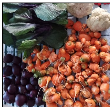
Cabbage leaves, beetroot, cauliflowers and carrots were harvested from our allotment by volunteer Jack.

The ground is now being prepared for next year's crop.