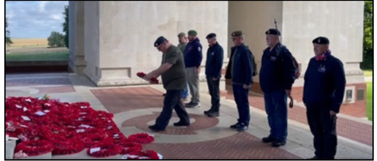
Thiepval War Memorial