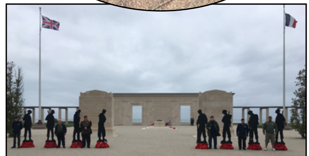
British Normandy Memorial