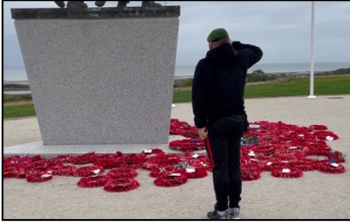
British Normandy Memorial